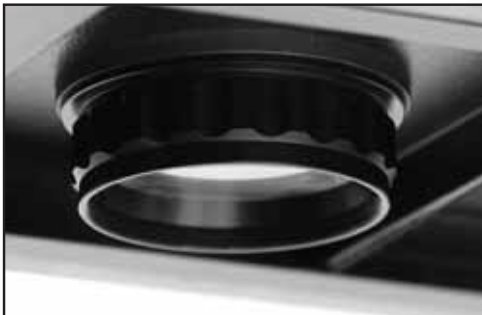
A large range of optical and laser choices offers the ultimate in flexibility.

© Vytek, 2007 Vinyl Technologies Inc. All Rights Reserved. Vytek's continuing program of product design, engineering and improvement make all specifications subject to change at Vytek's discretion. All mark, copyrights and images are the property of their respective owners.